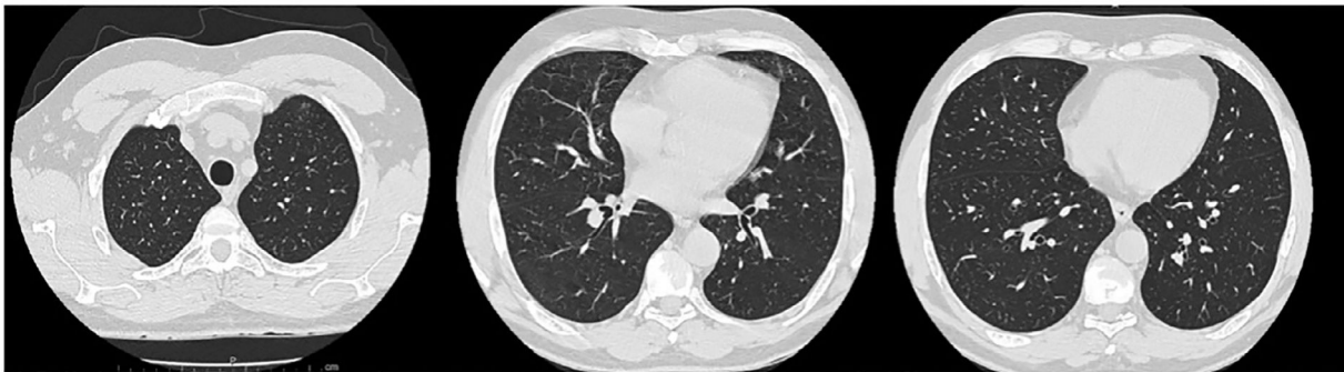
Fig. 2 CTscan, four months after the onset of disease, showing complete resolution of the lung opacities.

in the literature. 5,6 In our case, the patient presented a sub-acute onset of symptoms, initially presenting three weeks after the COVID-19 diagnosis with lung opacities and blood eosinophilia and then confirmed BAL eosinophilia. This patient was not taking any chronic medication and was not exposed to smoking, illicit drugs, or toxins and showed a dramatic response to corticosteroid treatment. This clinical case supports the already current evidence in which it is important to consider the development of interstitial lung disease in patients with COVID-19 including eosinophilic pneumonia. Despite the absence until now of a known mechanism for eosinophilic pneumonia in SARS-CoV-2, we believe that just as with other viruses, SARS-CoV-2 in rare cases can trigger an eosinophilic response. 7