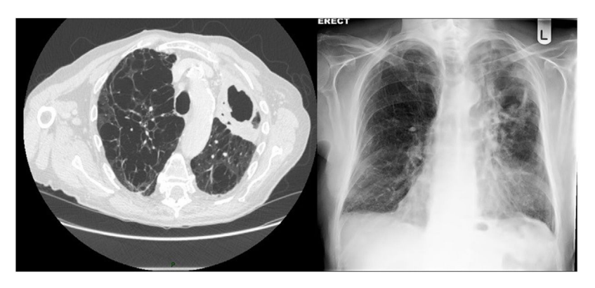
Figure 3 An example of cavitary non-tuberculous mycobacterial disease. The patient has COPD and severe emphysema is evident on the CT scan. In the left upper lobe there is a thick walled cavity. Sputum samples were persistently positive for M. avium .

is often described in textbooks and review articles as being to render the sputum negative by culture for NTM for 12 months which is important and the definition of microbiological response. Nevertheless, the initial discussion regarding whether to initiate treatment should take into account what the patient wishes to achieve with therapy, and not only a discussion of microbiological considerations. 85-87