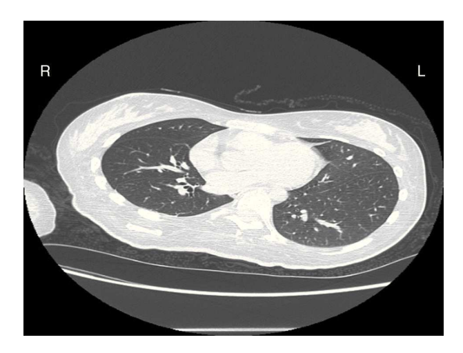
Figure 3 Chest CT scan one month after hospital discharge: complete resolution.

neuromuscular patient in whom physiotherapy techniques alone did not produce a rapid significant improvement.