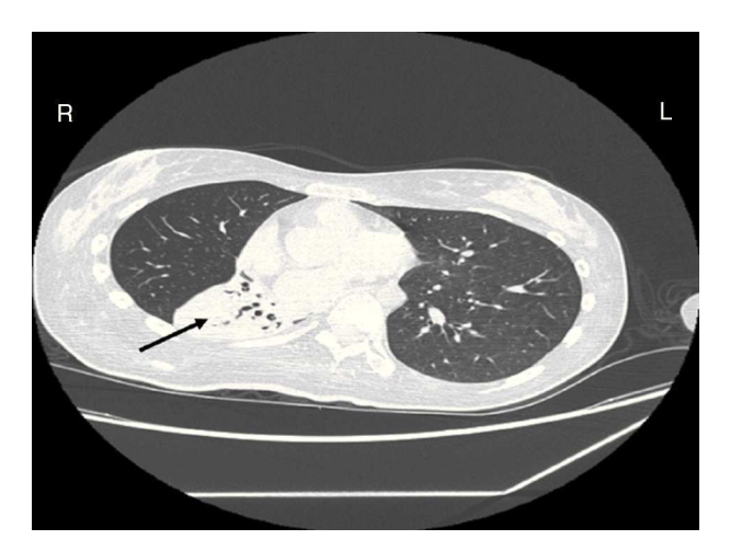
Figure 1 Chest CT scan at admission: atelectasis of the lower right lobe.