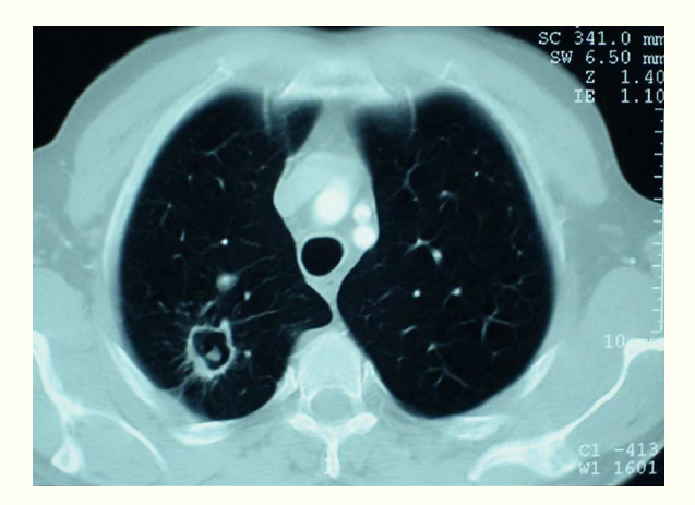
Figure 2 Chest computed tomography showing an aspergilloma of the posterior segment of the right upper lobe.

showed an excavated mass of the ventral and posterior segment of the right upper lobe, respectively (Figs. 1 and 2), and bronchoscopy localized the origin of hemoptysis in the upper right bronchus. We performed a right upper lobectomy. Macroscopic examination of the specimen showed the presence of aspergillus material (Fig. 3), confirmed by histological exam. Itraconazole 100 mg/day was given for 3 months.