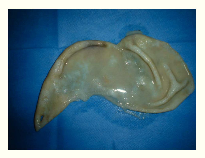
Figure 4 Post-operative view of an hydatid membrane.

communications and a colonization by Aspergillus sp. within the hydatid cavity.