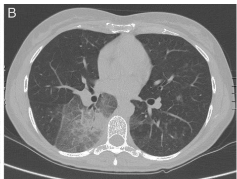
Figure 2 Chest high-resolution computed tomography (HRCT) at diagnosis (A) and two years after diagnosis (B). Bilateral lung infiltration in the lower lobes, particularly on the right side in the area of segment S6, with the following dimensions: 85 \,\mathrm{mm} \times 38 \,\mathrm{mm} \times 70 \,\mathrm{mm} . The surrounding tissue shows ground-glass opacities, thickened interlobular septa, and a craving paving picture with air bronchogram (A). Partial regression of pulmonary infiltration after discontinuation of 'baby body oil therapy' (B).

giant cells, optically empty spots, a foreign body reaction with granulomatous process. All vacuolated macrophages contained lipids (lipophages) and represented 35% of all cells in the biopsy. This finding raised the suspicion of oil substance aspiration - ELP (Fig. 3). Subsequently, the patient confessed to daily nasal application of baby body oil drops (with azulene and medicinal liquid paraffin) over a period of five years to treat the dryness of her nasal mucosa. The otorhinolaryngologic examination was normal. The patient refused glucocorticoid therapy. Regular controls of the pulmonary function test, chest X-ray (Fig. 1B) and HRCT of thorax were performed in the patient. Two years after discontinuing "baby body oil therapy", a chest CT scan revealed partial improvement (Fig. 2B). We proposed additional corticosteroid therapy due to persisting lesions on CT. However, this therapy was refused by the patient.