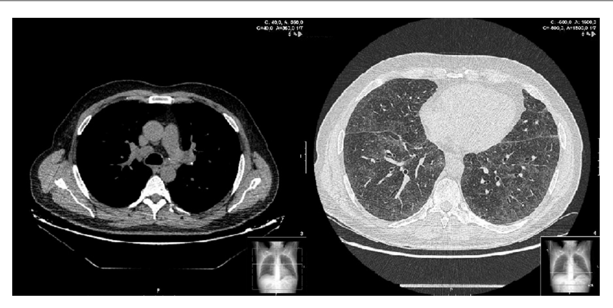
Figure 1 Sarcoidosis in 50 years-old man, coinfected with HIV and HCV, and treated with telaprevir-based triple therapy. Thinsection of thoracic CT shows bilateral and diffuse ground-glass opacities, and multiple centrilobular micronodules.