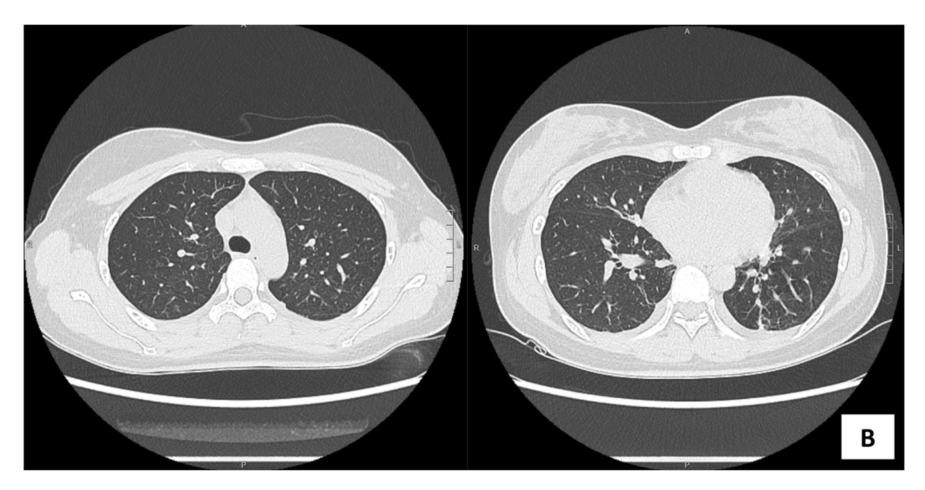
Fig. 1 A/B: A) Chest CT-scan before ICU admission and pronation; bilateral pleural effusion, with bilateral diffuse consolidation areas and ground-glass opacities. B) Chest CT-scan at 36 h after ICU admission, with reduction of the consolidation pattern.

intubation (ROX index > 5.99).<sup>10</sup> No sedation was needed, as the patient was compliant with the therapeutic plan used.