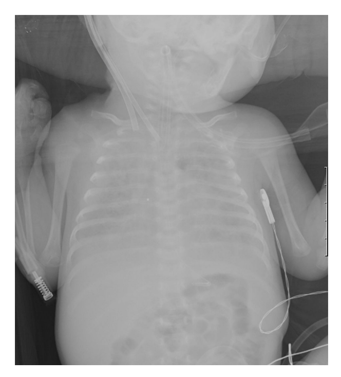
Figure 1 Chest radiograph. Persistent image of bilateral reticulogranular pattern after 2 weeks of ECMO.

After death lung and skin biopsies were performed, with written consent from the parents. The lung biopsy revealed chronic pneumonitis of the infant (Fig. 2).