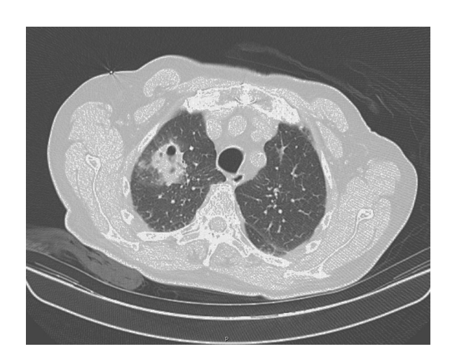
Figure 1 Computed tomography (CT) showing solitary pulmonary lesion in the upper right lobe. The lesion has irregular boundaries and a caveated component is exhibited.

We received a RULobectomy of 133 g weight gross and measuring 20 \text{ cm} \times 10.5 \text{ cm} \times 3.5 \text{ cm} with areas of irregular visceral pleura that on cut surface revealed pleural thickening and subpleural dense tissue with a nodule measuring 3 \text{ cm} \times 2.5 \text{ cm} \times 3 \text{ cm} ; a caveated lesion with 1.5 cm was also detected, surrounded by dense lung parenchyma.