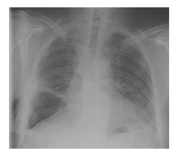
Figure 1 Chest X-ray on 12th day after right midle lobectomy and 24 h after chest tube remotion.

parameters initially improved the patient had a persistent air leak with a stable asymptomatic pneumothorax on water seal that increased whenever negative suction was suspended and the chest drain was left in free drainage.