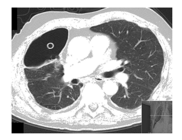
Figure 2 Thoracic CT scan showing pleural cavity with a chest tube inside and pleural thickening.

This time, instillation of methylene blue (1 ampoule diluted in 1 liter saline solution) via chest tube was used to locate the bronchial segment leading to the fistula. While the blue solution was being instilled another clinician looked through the bronchoscope and watched the blue solution