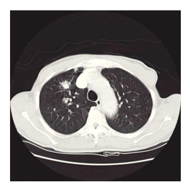
Figure 2 CT on presentation. Another level.

Among these the presence of amyloid nodules opacification on chest imaging or histologic sampling almost uniformly indicates localized disease. The incidence of nodular disease is unclear because many are diagnosed incidentally at open lung biopsy or at autopsy. Among 223 autopsies of patients with amyloidosis between 1889 and 1979, only three cases with isolated nodular lung disease were identified.<sup>10</sup> Utz et al.<sup>11</sup> reported seven cases of nodular disease over a 13-year period, whereas Hui et al.<sup>12</sup>