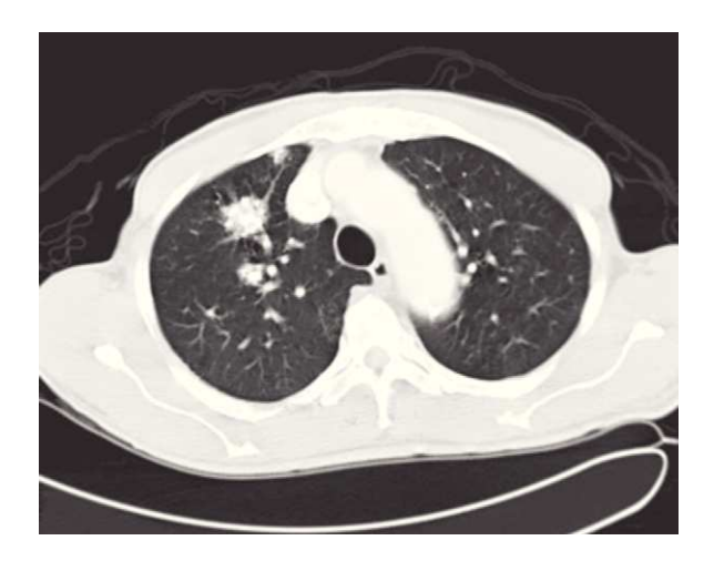
Figure 3 Follow-up CT scan showing the nodule increase in size and with spiculation.

described 25 patients with lung nodules in the absence of plasma cell dyscrasia. The lesions range from 0.6 to 9 cm (mean of 3 cm) in size, present as multiple nodules of varying size in 58% of cases, and often appear peripherally in the lower lobes.<sup>12,13</sup> The amyloid deposit is typically surrounded by plasma cells, lymphocytes, and giant cells; small amounts of amyloid can be found in contiguous blood vessels.<sup>10,12</sup>