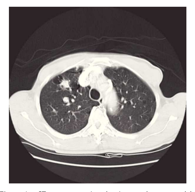
Figure 1 CT on presentation showing a pulmonary nodule 2 \text{ cm} \times 2 \text{ cm} in size.

is well established. Three forms of pulmonary disease exist in localized AL amyloid: (1) nodular opacities, (2) diffuse opacities, and (3) tracheobronchial disease. A 1983 literature review of localized amyloid lung disease identified 126 cases only, 44% having nodular disease, 3% with diffuse opacities, and 53% exhibiting tracheobronchial amyloid.<sup>8,9</sup>