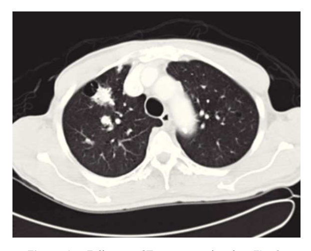
Figure 4 Follow-up CT scan same level as Fig. 2.

The pathogenesis of organ involvement in AL disease, be it systemic or localized, arises from the deposition of monoclonal \kappa or \lambda immunoglobulin (Ig) light chains. In systemic disease, clonally expanded plasma cells residing in the bone marrow secrete excessive quantities of monoclonal Ig, which circulates in blood to target organs. Typically AL deposits are composed of the variable region of \lambda VI or \kappa I light-chains. Less commonly, part or the entire Ig constant region is represented. Genotyping of these two light-chain