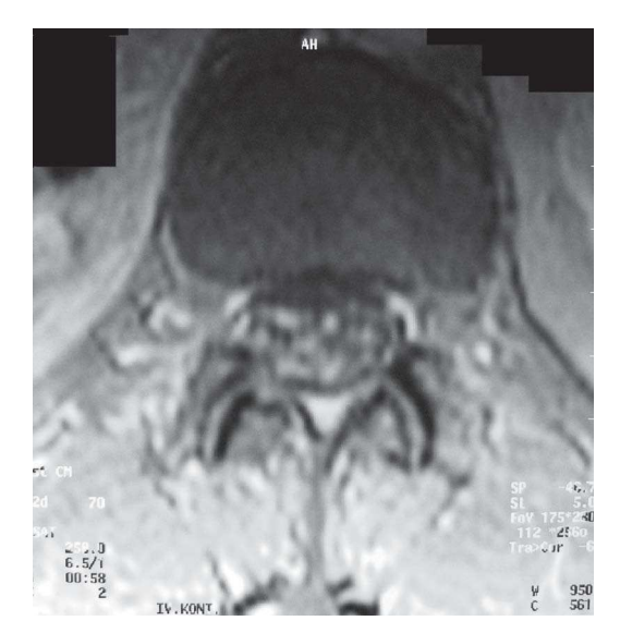
Fig. 2 – Transverse T1-weighted gadolinium-enhanced MRI scan at the L1-2 level. Enhancement of the cauda equina fibers in the thecal sac is seen

The tumor cells could reach the leptomeninges by several mechanisms: Arterial route (in patients with disseminated cancer, the leptomeninges are infiltrated through arachnoid vessels or choroid plexus); direct extension of the leptomeninges or seeding (primary CNS tumors), growing around and along peripheral nerves to the subarachnoid space (systemic tumors), iatrogenic (seeding of subarachnoid space during surgical extirpation of intraparenchymal metastases), entry to the subarachnoid space through the venous plexus of Batson and perivenous spread from adjacent bone marrow metastases. In most cases of breast or lung cancer pure leptomeningeal carcinomatosis is the result of cancer propagation from vertebral or paravertebral metastases<sup>1-4,9</sup>. New metastatic deposits along meningeal surfaces which invade subpial parenchyma, penetrate spinal nerve roots, and produce masses in the subarachnoid space.