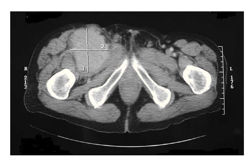
Fig. 2 – Axial CT of the pelvis showing a lymph node in the right inguinal region

now irresectable (Fig. 2). The patient received palliative radiotherapy (36 Gy in 12 fractions); pain relief was achieved and partial regression of the mass was observed after the treatment was completed. Unfortunately, he died of progressive disease 5 months later.