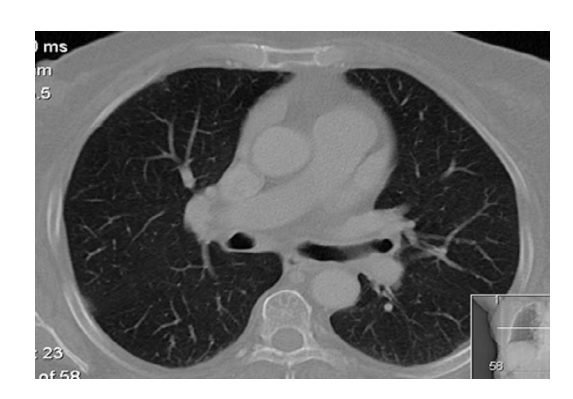
Fig. 1 – Thoracic CT scan: circumferential wall thickening of the main bronchi

of the chest showed circumferential wall thickening of the trachea and the main bronchi, with no relevant lung parenchyma abnormalities (Fig. 1). Pulmonary function tests revealed the following values (as % predicted): FVC: 101%, FEV1: 87%; FEV1/FVC: 71%; PEF: 48%; FEF 25-75: 58%; FEF 50: 53%; FEF 75: 76%; VC: 96%; TLC: 87%; RV: 86%; RV/TLC: 41%.