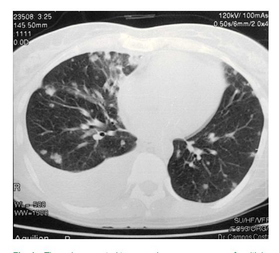
Fig. 1 – Thoracic computed tomography scan: presence of multiple bilateral pulmonary nodules, approximately 1 cm or less in diameter, ill-defined, non-calcified, with low-density, scattered throughout the lungs, predominantly in the peripherical region, and a right-sided pleural effusion; no hilar or mediastinal lymphadenopathy were seen.

The patient underwent a diagnostic thoracotomy in order to obtain a definitive histological diagnosis.