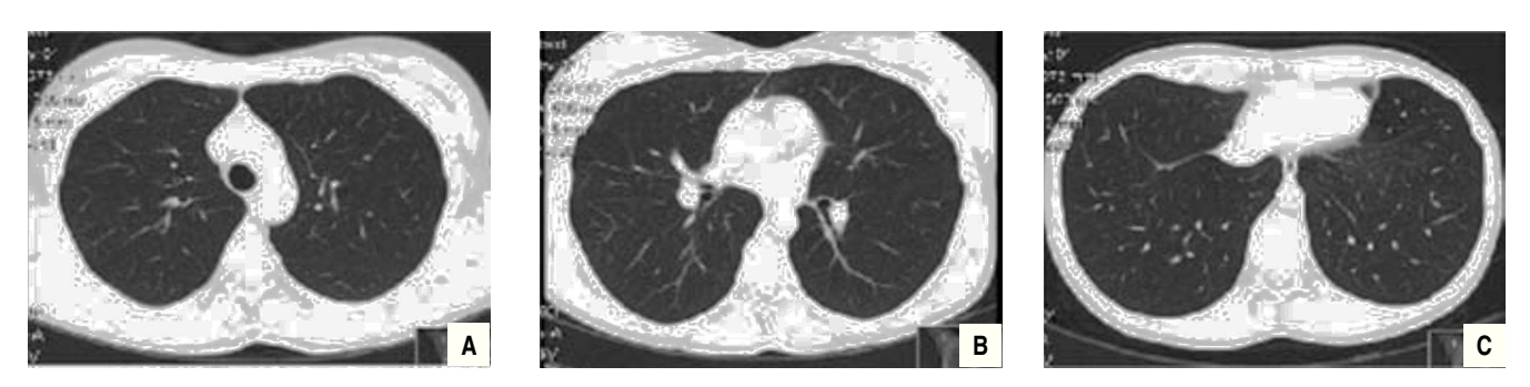
Fig. 2 - (A,B and C) High-resolution computed tomography of the chest

Ten months after the first visit, the patient was still away from work, without respiratory symptoms outside the context of common colds, and her physical examination was still normal, as well as pulmonary function tests and methacoline challenge. So as to exclude any involvement not detected by the previous tests, fiber optic bronchoscopy was then performed, with unremarkable endoscopic findings. However, the bronchoalveolar lavage done in the right middle lobe revealed a lymphocytosis (32,4%) with a normal CD4/CD8 ratio.