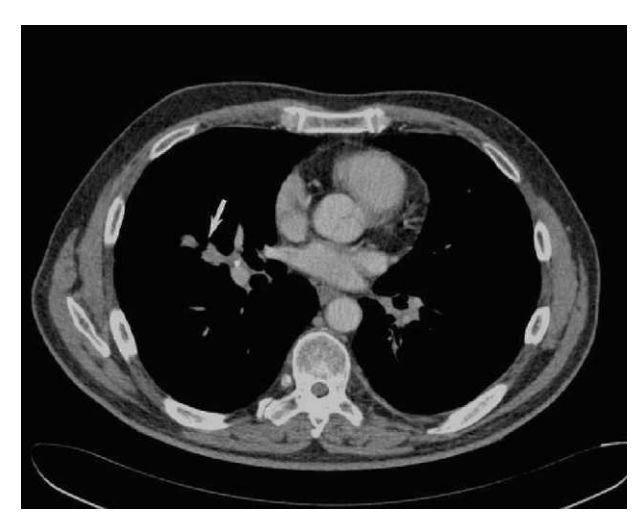
Figure 1 CT image showing the nodule in the middle lobe.

The two malignancies may originate from the same organ or occur as metastases from other sites. There is no histological admixture or intermediate-transition cell population zone. These tumors are difficult to diagnose preoperatively and pathological identification of the dual components is often the only way to make a correct diagnosis.<sup>1</sup>