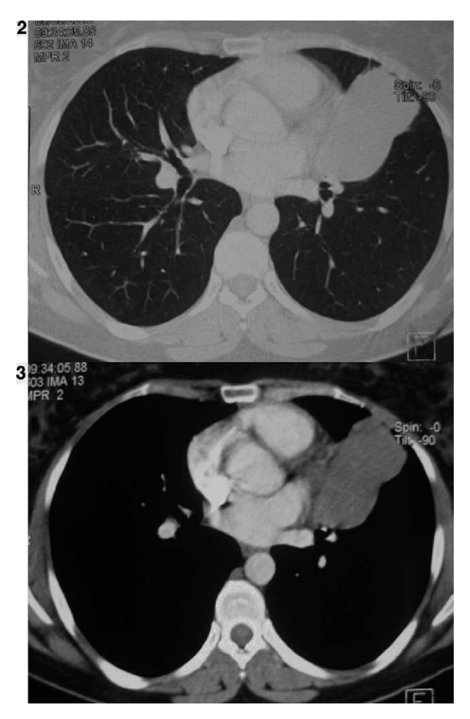
Fig. 2, 3 A computed tomography scan showing an inhomogenous mass partially cystic, budding at the lingular bronchi and then develops in intrathoracic without mediastinal lymphadenopathy or pleural effusion.

Microscopic examination of an endobronchial biopsy (Figs. 4 and 5) showed an obviously malignant tumor process which was extensively ulcerated on the surface. It was made up of malignant glandular cells growing in tubules and papillary structures, sometimes reproducing endometrioid differentiation. These malignant cells had prominent clear cytoplasm, and squamoid morules were present. Some of the lumen of the glands were empty, others contained eosinophilic material. The dividing stroma was fibrous. Large areas of necrosis were observed.